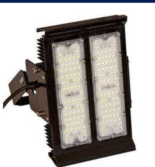
75 -100W LED FLOODLIGHT