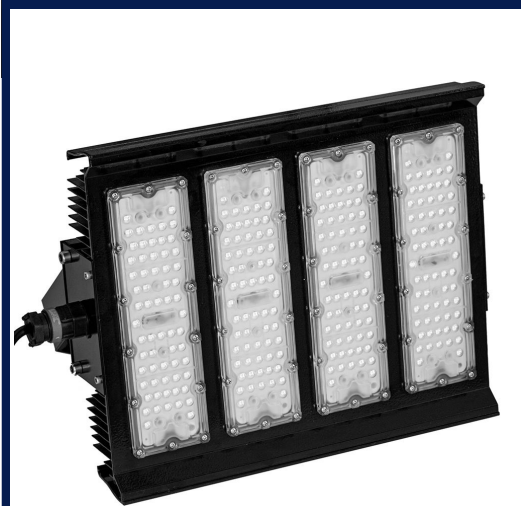
200W LED FLOODLIGHT