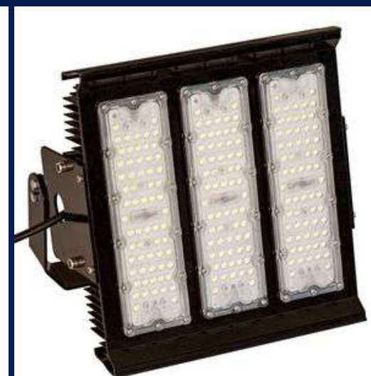
150W LED FLOODLIGHT