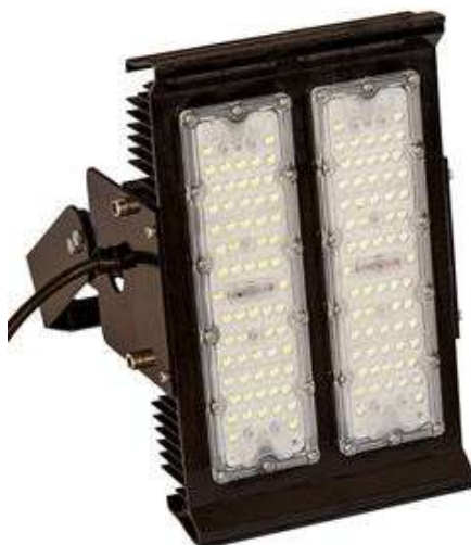
75 -100W LED FLOODLIGHT