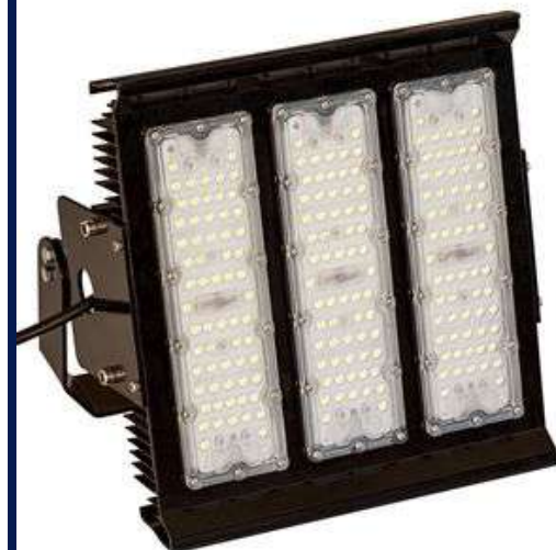
150W LED FLOODLIGHT