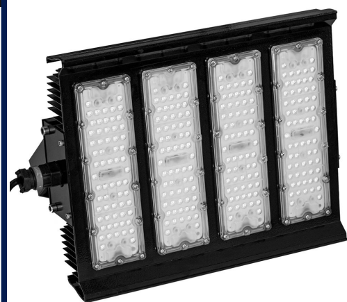
200W LED FLOODLIGHT