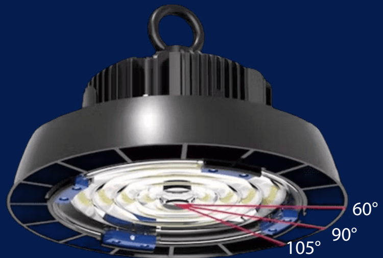
Adjustable Beam Angle LED Highbay